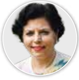
Justice Hima Kohli

Chairman of the Board School of Law IILM University