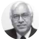
Dr S. Y. Quraishi Chancellor Emeritus IILM University, Gurugram Former Chief Election Commissioner of India